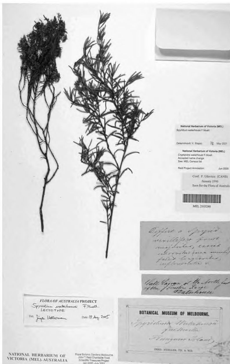
Fig. 2. Cryptandra waterhousei . Photograph of lectotype (F.G. Waterhouse s.n., MEL 2103248).